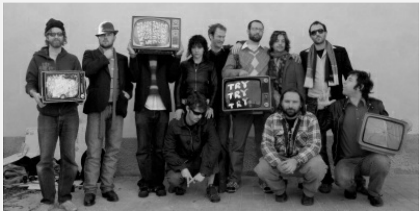
20 Watts tallies up the discography of Broken Social Scene!

Filed under: Issue 22 | Tags: 7/4 Shoreline , All to All , Almost Crimes , Amy Millan , Anthems for a Seventeen Year-Old Girl , Best of the Decade , Brendan Canning , Broken Social Scene , Broken Social Scene Presents , Emily Haines , Feel Good Lost , Forgiveness Rock Record , Kevin Drew , Leslie Feist , Something for All of Us... , Spirit If... , World Sick , You Forgot It in People